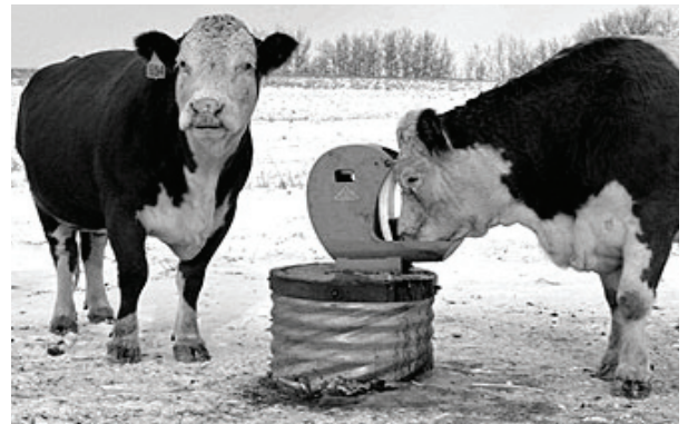
Photo: Frost-Free Nose pump

The solar pump unit used in the demonstration is set up to be a self contained portable or moveable watering station designed to be rotated around to protect pastures and water supplies.