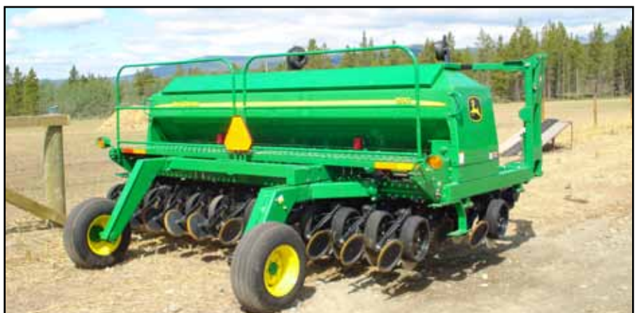
Photo: YAA no till drill. This drill is available for rent, contact YAA for more info visit the YAA website at yukonag.ca or contact YAA at 867-668-6864.

Established plants have all the advantages in renovated pastures.