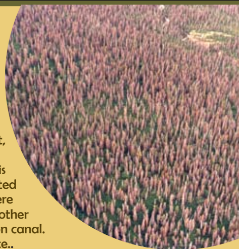
Tree Mortality In Klane National Park

As mentioned, the current infestation began in the southwest Yukon around 1990. At over 350 000 ha in size, it is by far the largest and most intensive spruce beetle outbreak ever recorded in Canada, and 15 years later there is no end in sight. In 2004, nearly 100 000 ha of recent mortality was mapped during aerial surveys; the second largest since aerial surveys began in 1994. Prior to the current out-break, only two outbreaks had been recorded; both in the southwest, and both directly associated with industrial activity. In the early 1940s, approximately 50 000 ha was infested around Dezadeash Lake. Though there is conflicting information regarding the cause, it was thought to have been associated with the building of the Haines Road in 1942. During construction many trees were felled and left, providing ideal conditions for a rapid increase in populations. Another infestation in the late 1970s was linked to the Aishihik power project and diversion canal. This infestation lasted two years and affected only about 100 ha of mature spruce..