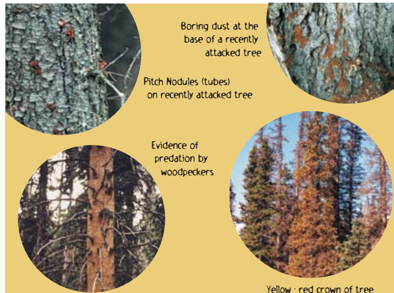
Boring dust at the base of a recently attacked tree