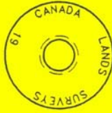
CLS '69 POST