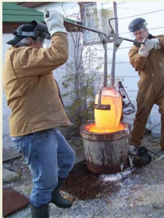
Government of Yukon

Despite these positive signs, there were still several obstacles to overcome. One was to establish a "chain of custody" for Yukon placer gold. Most gold in the world is sold and then shipped to refineries for processing, where gold from many sources is mixed together to obtain a final product. The challenge was to find a way to refine Yukon's placer gold in a separate process. The other key piece of work was a certification process that would guarantee Yukon placer gold met all the conditions required to be ethical.