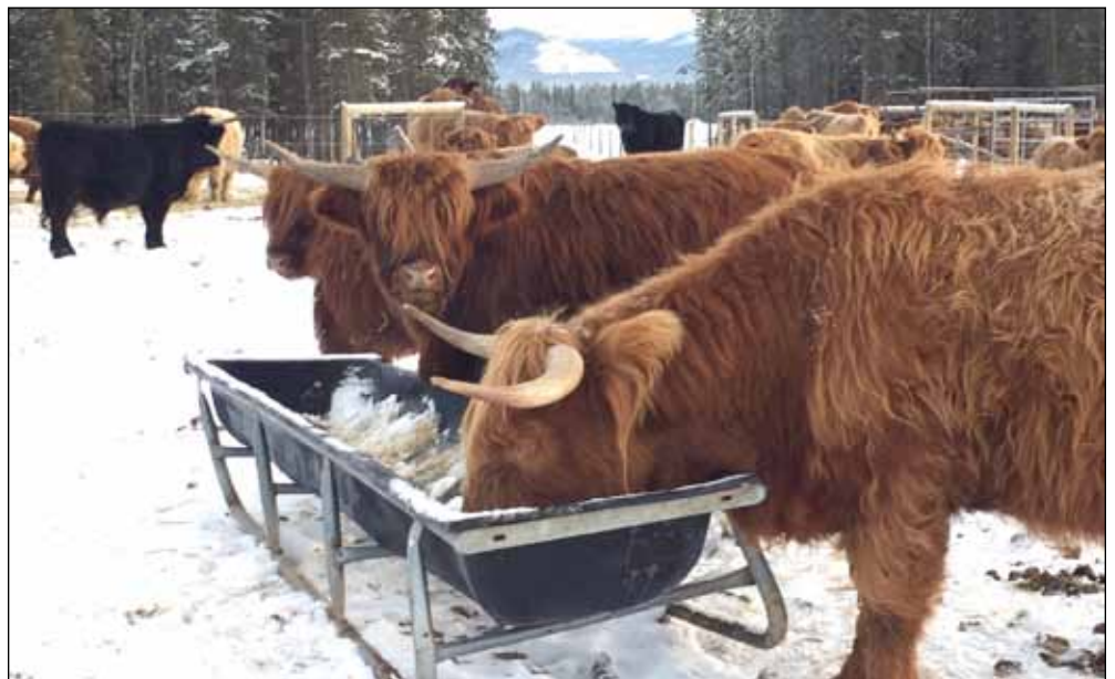
Photo: Yukon Valley Farm Highland beef. Go to the Producer Profile to find out more about Yukon Valley Farm

The Agriculture Branch would like thank everyone who made this year's conference a success. Thank you.